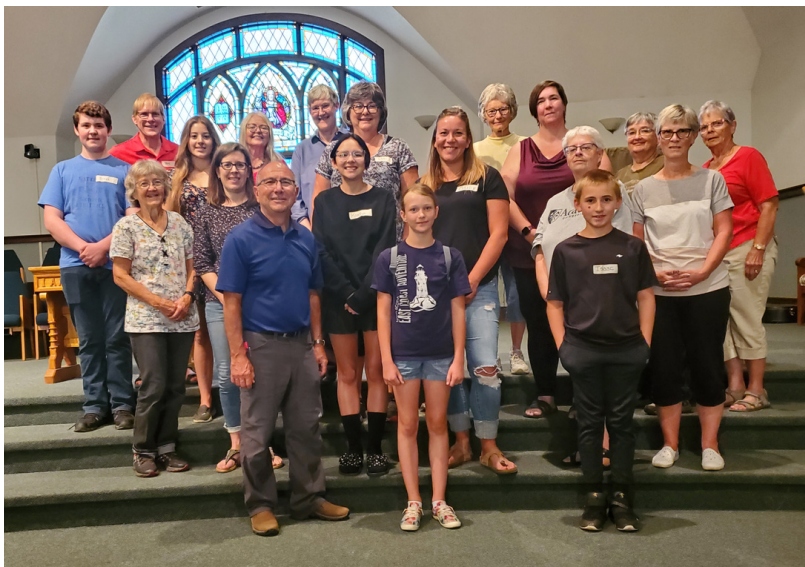
VBS 2022 Volunteers